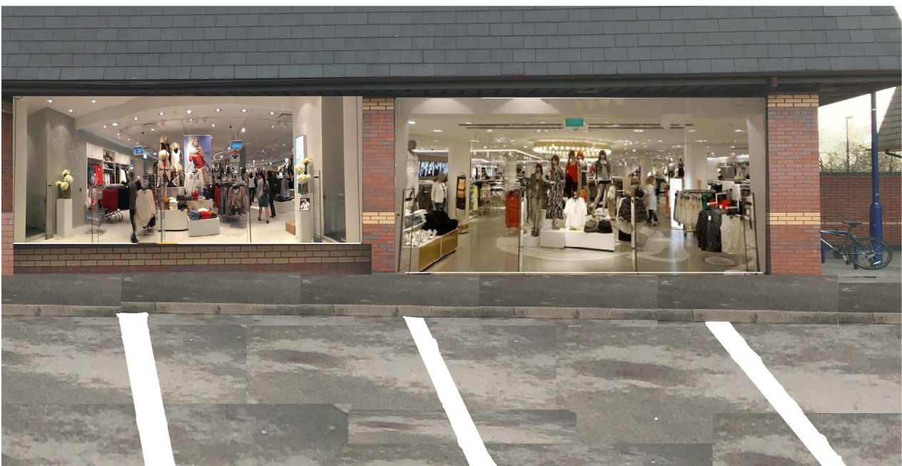
Above is a computer generated image of the possible shop front.